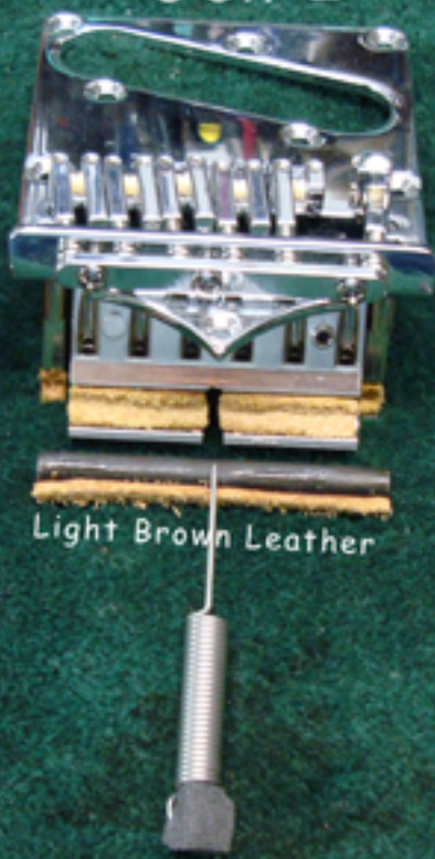
TKS Gen 2