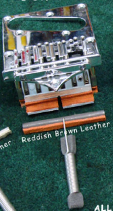
TKS Gen 1